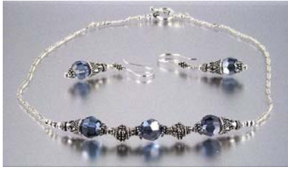
Sterling silver necklace and earrings

and earrings with Austrian Swarovski crystals by Designs by Fleur. Value: $95